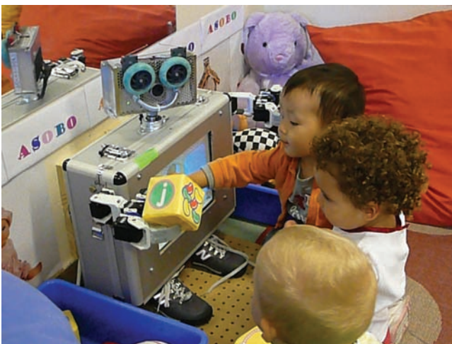
Fig. 4. A social robot can operate autonomously with children in a preschool setting. In this photo, toddlers play a game with the robot. One long-term goal is to engineer systems that test whether young children can learn a foreign language through interactions with a talking robot.

The science of learning has also affected the design of interventions with children with disabilities. Speech perception requires the ability to perceive changes in the speech signal on the time scale of milliseconds, and neural mechanisms for plasticity in the developing brain are tuned to these signals. Behavioral and brain imaging experiments suggest that children with dyslexia have difficulties processing rapid auditory signals; computer programs that train the neural systems responsible for such processing are helping children with dyslexia improve language and literacy (76). The temporal "stretching" of acoustic distinctions that these programs use is reminiscent of infant-directed speech ("motherese") spoken to infants in natural interaction (77). Children with autism spectrum disorders (ASD) have deficits in imitative learning and gaze following (78–80). This cuts them off from the rich socially mediated learning opportunities available to typically developing children, with cascading developmental effects. Young children with ASD prefer an acoustically matched nonspeech signal over motherese, and the degree of preference predicts the degree of severity of their clinical autistic symptoms (81). Children